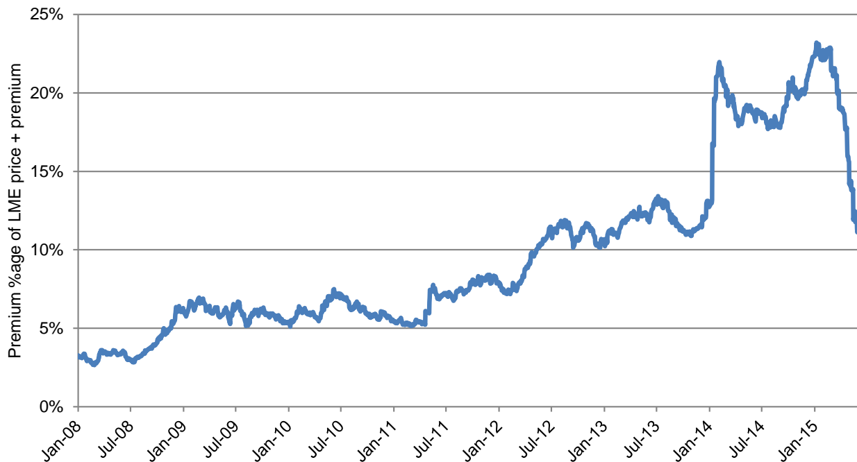
Premium percentage of “all-in” LME aluminium price (LME price + US Midwest premium per Metal Bulletin)